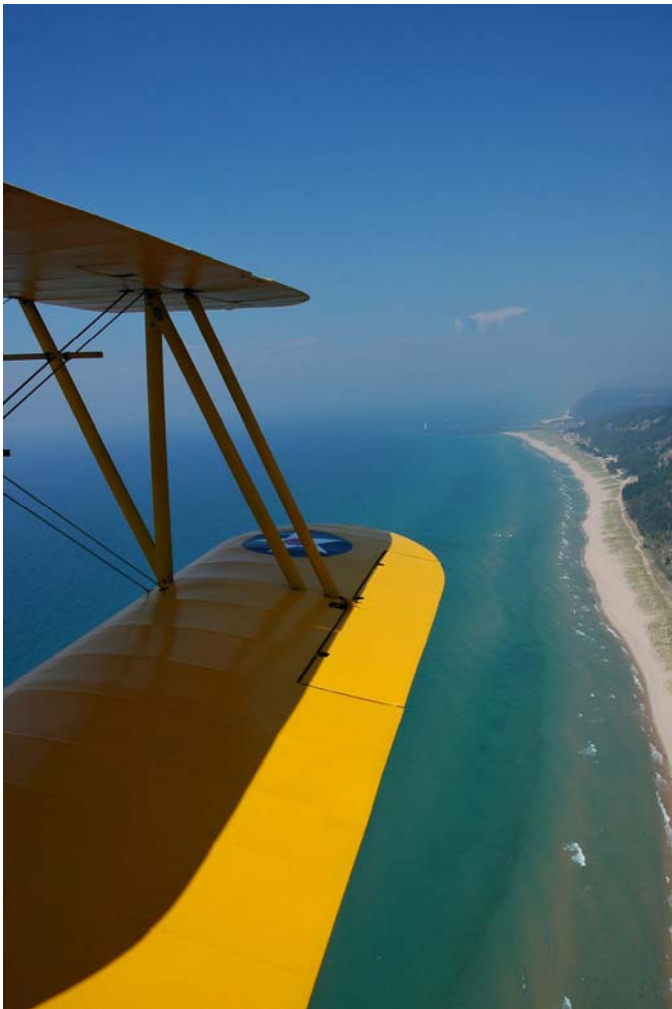
Flying by Silbernagel