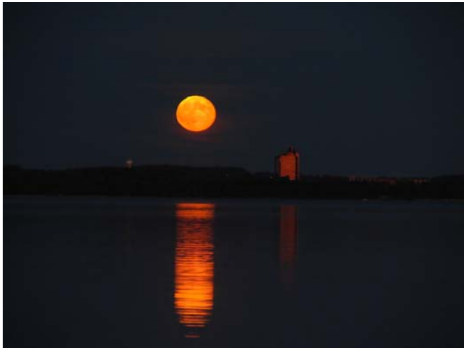
By S. Bojack