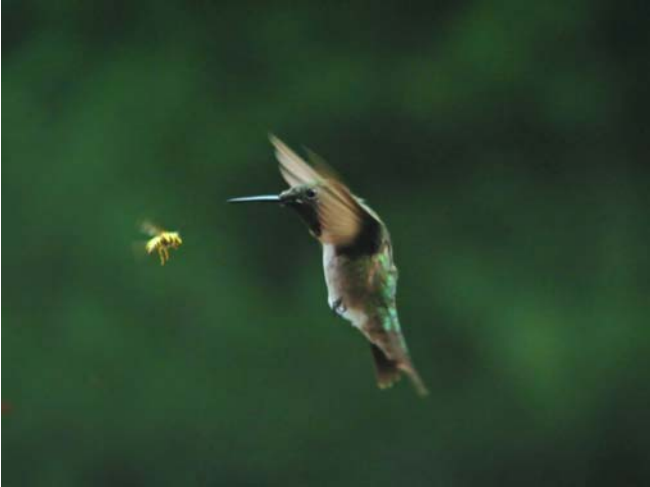
By S. Bojack