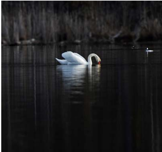
By B. Bojack