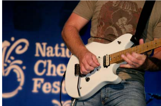
A Pickin & a stummin