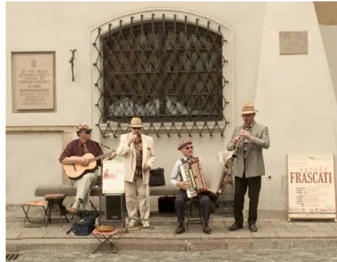
Street musicians Warsaw by K. Carpenter